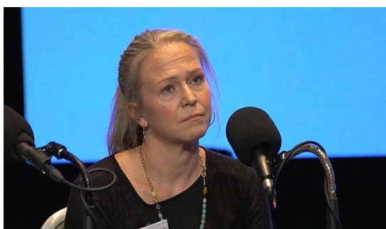
Kellie Bright (Linda Carter in Eastenders)

For the BBC Careers Event, two actors from the show EastEnders, a BBC soap, came to our school to speak to all the children about their careers and how they became actors. These two actors were asked questions about their careers which gave us an insight into their daily