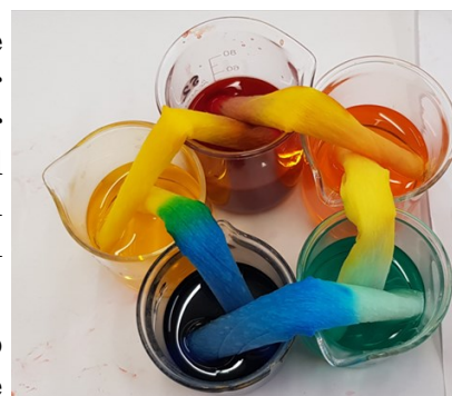
Dr Rathod, Science

Students also made iconic lava lamps using cooking oil, tap water, food dyes and sodium hydrogen carbonate to make the colours rise, float and sink. Spectacular and mesmerising bubbles could be seen in the boiling tubes.