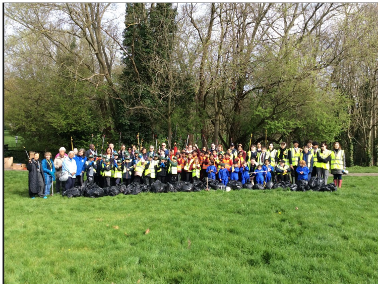
Community litter pick in Woodcock Park in aid of The Great British Spring Clean. Article Page 4.