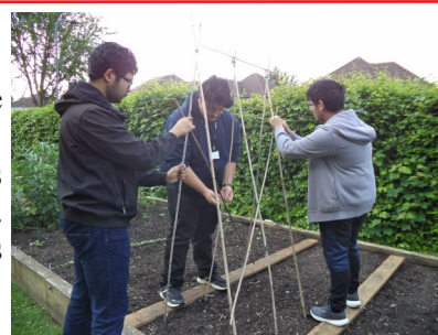
Erecting the structure for climbing beans.