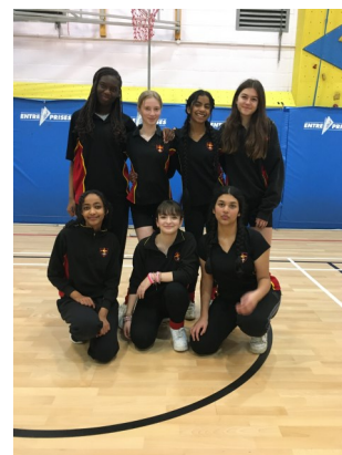
Y9 Netball Team