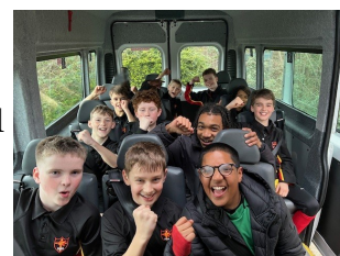
Y7 boys' football team