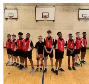
Y7 basketball team