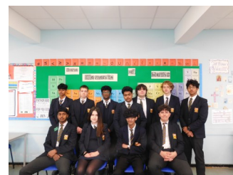
Y11 Silver & Gold Winners