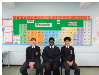
Y9 Silver Winners