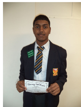
Winner: Christmas writing competition.