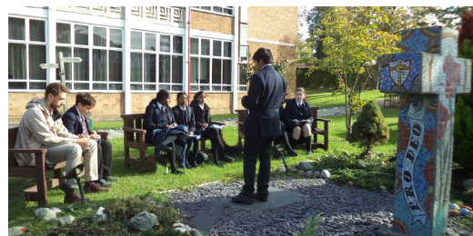
Pupils praying the Rosary in the Remembrance Garden.