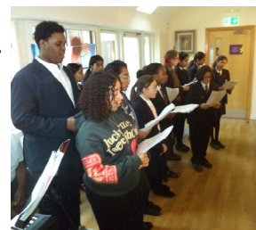
Carol Singing at St Luke's Hospice.