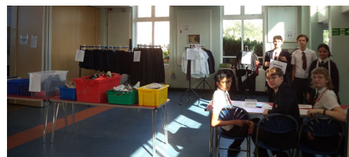
Eco Committee opening upcycled uniform shop to new Y7 families in July. They raised £700 for St Greg's Pantry.

The upcycled uniform shop is proving more popular than ever with parents, but we are short of girls' uniform: Girls' blazers, skirts and girls PE tops. If you have uniform and/or PE kit your child has grown out of and it is in good condition, please donate it via the School Office. Not only does this reduce waste, it helps parents save money and all proceeds are used to purchase food for St Greg's Pantry, supporting families in need. In addition, 6th Form students may wish to consider donating their Year 10/11 tie. Eco Committee