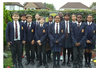
Our Travel Ambassadors 2023/24

St Gregory's Travel Ambassadors would like to remind all parents and pupils to use active forms of travel or public transport wherever possible when traveling to and from school. This will help to reduce congestion around school, improve safety and contribute to a reduction in pollution and an improvement in healthy lifestyles.