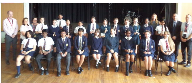
Coronation Competition Winners receiving their prizes from the Headteachers of the All Saints Trust Schools. Full story P2.