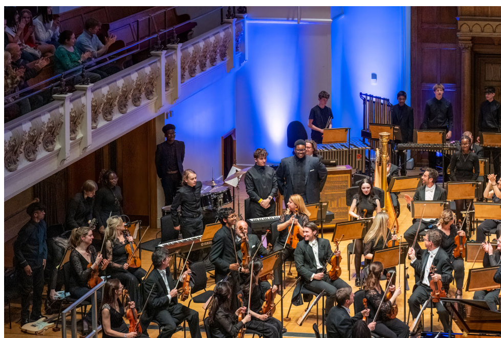
Some of St Gregory's musicians standing to receive applause after their performance with the RPO.