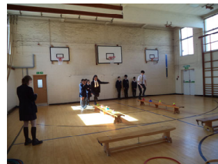
Road safety obstacle course.